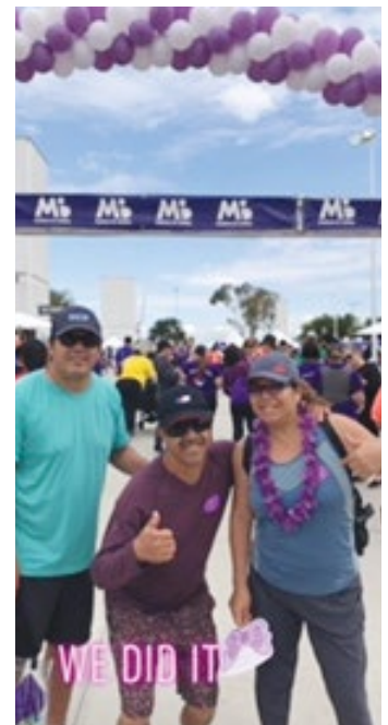
SAN GABRIEL VALLEY AND ORANGE EMPIRE MEMBERS MARCH FOR BABIES.

There are so many benefits to newborn screening! EVERY baby is screened regardless of economic background, ethnicity, religion... every baby matters. EVERY state has a program. This allows consistent care across the country. This means that whether a baby is born in Maryland, Oklahoma, or California he/she will be screened to prevent death or disabilities from at least 29 treatable diseases.