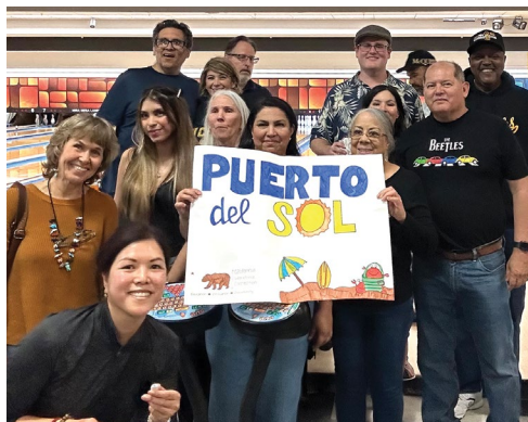
PINS WILL ROLL WITH THE PDS CHAPTER! PUERTO DEL SOL GETS A SLICE OF LAUGHTER AT THE BOWLING PIZZA PARTY

The bowling alley became the perfect backdrop for building meaningful connections and learning about our members'