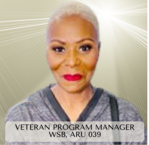
VETERAN PROGRAM MANAGER WSB, ARU 039