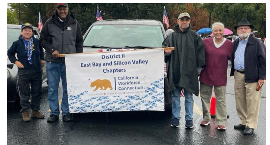
SAN JOSE VETERANS DAY PARADE 2024

All in all, the parade was a huge success, which it usually is. There was not as many people that came out as other years, but I am pretty sure it was because of the rain. And for those that braved the elements to honor the brave, we also salute you. Remember, Veteran's Day is not to be confused with Memorial Day. Memorial Day honors those you lost their lives defending our country. Veteran's Day honors all vets who have and continue to defend our country.